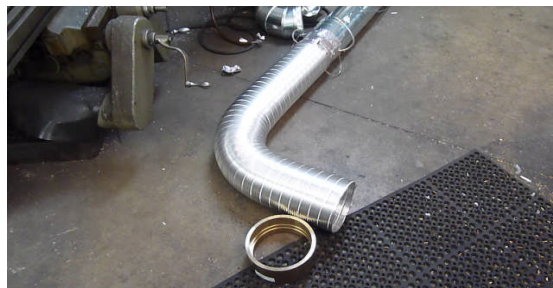
Tail piece used to test both types of ducts