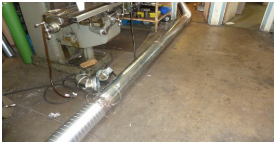
Sheet Metal sample connected