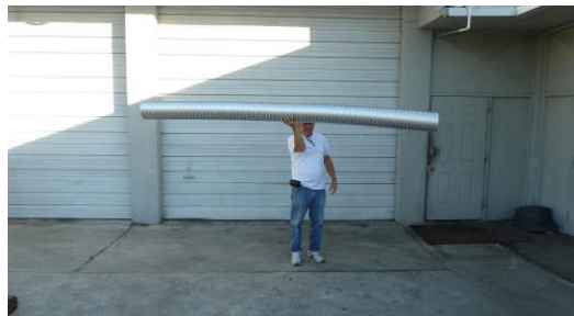
Self supporting characteristic